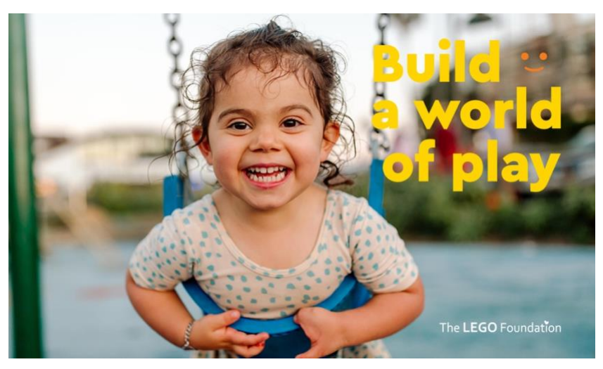
Build a World of Play Challenge